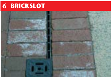
Install pavers or finish pavement surround to required level. Should be 2-3mm above slot. Bond pavers to cover and concrete haunch to prevent damage to slot when trafficked.

These illustrations are for guidance only, professional guidance should be sought.