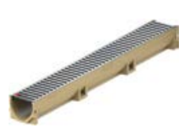
Unit I/6 Percival Gull Place Mangere, Auckland 2022 New Zealand