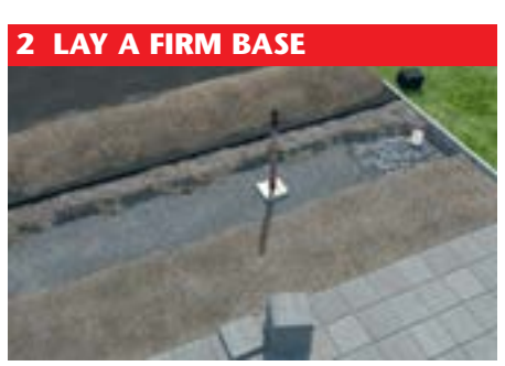
Pour concrete bed - 300mm wide by 100mm deep; keep outlet pipe clean.