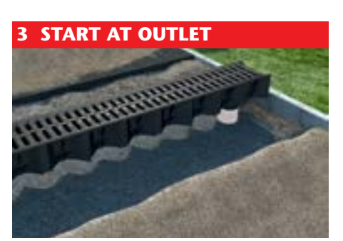
Lay channels starting at outlet. Set a string line at required height to ensure level. Seal joints if