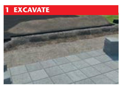
Excavate trench and fix a line to determine the alignment and finished height of proposed channel run.