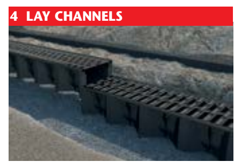
Continue to lay channels working away from outlet, channels slide-fit together.