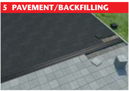
Pour 100mm concrete around channel sides allowing for pavement detail. Install pavers or finish pavement surround to required level. Should be 2-3mm above grate.