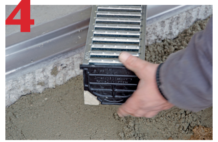
Fit end caps. Insert grates. To keep concrete from getting onto grates or seam, protect grates with plastic.