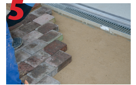
Install pavers or finish pavement surround to required level. Should be 1/8^{\prime\prime} above grate.