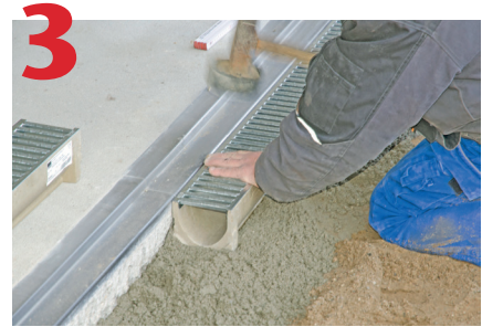
Lay channels starting at outlet. Set a string line at required height to ensure level. Seal joints if required.