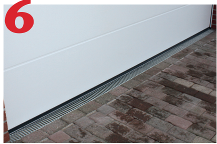
Clean away debris, remove protective plastic.